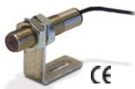
Remote Optical Sensor (ROS-P) Gap 36 inches

Optional plug-in Remote Sensors with 8 foot cables (100 feet optional)