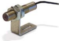
Remote Infrared Sensor (IRS-P) Gap 0.50 inches

Optional Remote Contact Assembly (RCA) with 6 foot cable.