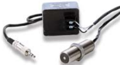
Remote Magnetic Sensor (MT-190-P) Gap 0.25 inches