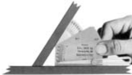
Checking Angle of Vertical Member