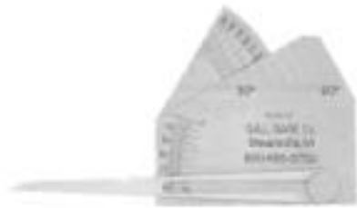
Gauge with Pointer Extended