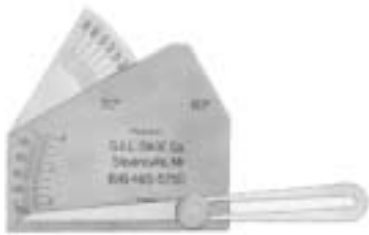
Gauge with Pointer Retracted

Replaces all other sets of gauges to measure fillet or groove welds in skewed members or members at 90 degrees.