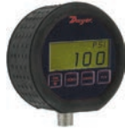
DPG-100 with Protective Rubber Boot