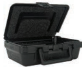
Protective Carrying Case