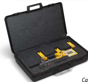
Carry case included

Dillon also manufactures highly accurate electronic and mechanical dynamometers and crane scales.