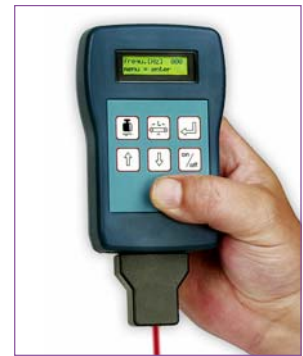
Plug-in type sensor allows one-handed operation